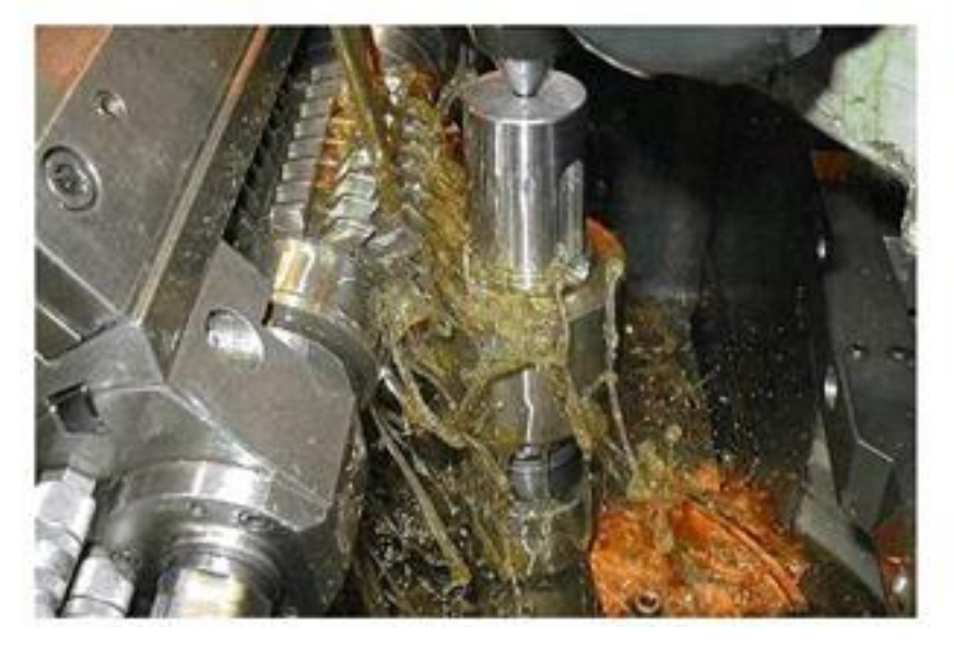
Exhibit 1 depicts cutting fluid at work.

Cutting fluids are essential to remove the considerable frictional heat generated at the tool/workpiece interface, to extend the life of cutting tool edges, and also to lubricate the cutting tool to prevent adhesion to the machined metal. Industrial-grade metal machining (with large feeds and speeds) makes the need for cutting fluids more acute (Please refer Exhibit 1). Another function of such fluids is to minimize rust on machine parts and tool holders. The available varieties of cutting fluids are many, including: water-based fluids, oil-based fluids, oil/water emulsions, gels, pastes, solid waxes, aerosol mists, compressed air, and more. The oils can be mineral-based (from petroleum stock) or manmade synthetics. Plain water was reportedly the first coolant/cutting fluid applied in machine shops back in the 19<sup>th</sup> century.