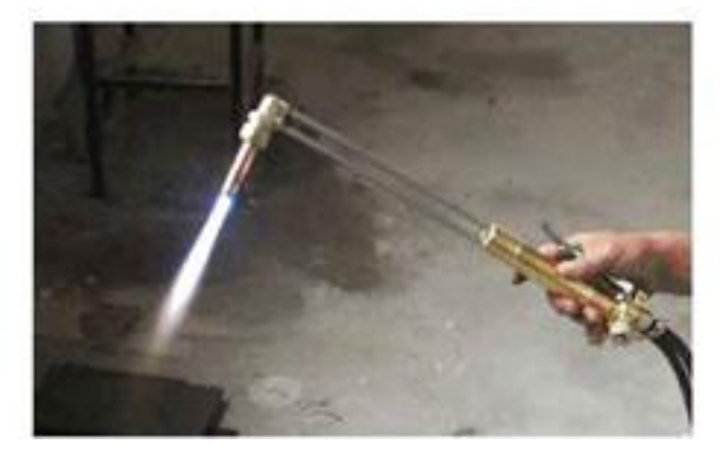
Exhibit 2 depicts an oxy-fuel cutting torch in action.

fuels) (Please refer Exhibit 2) will do the job, as well as electric-energized welding and cutting torches (such as plasma arc). It must be understood that, in trade for beneficial speed and ability of rather hot torches to cut through virtually any material, a considerable amount of heat will be introduced to the work piece, which can damage the temper or heat treatment properties, and perhaps burn the metal.